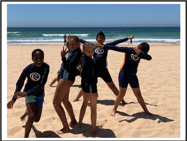
Manly Beach Surf School

Forbes Street, Woolloomooloo 2011 Telephone: 9358 5335/6 | Fax: 93571831 plunketstr-p.school@det.nsw.edu.au