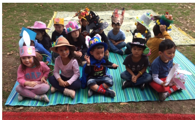
Easter Hat Parade 2019

Forbes Street, Woolloomooloo 2011 Telephone: 9358 5335/6 | Fax: 93571831 plunketstr-p.school@det.nsw.edu.au