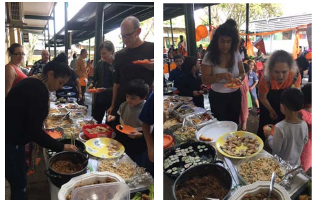
Harmony Day, 2019

Forbes Street, Woolloomooloo 2011 Telephone: 9358 5335/6 | Fax: 93571831 plunketstr-p.school@det.nsw.edu.au